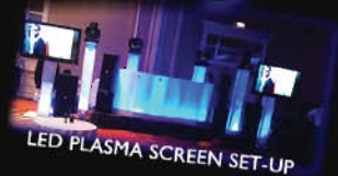
LED PLASMA SCREEN SET-UP

SPECIALIZING IN ALL OCCASIONS: WEDDINGS - INCLUDING SANGEET, MENDHI, GARBA & DANDIYA NIGHT, BARAATS, DOLI & VIDAI CORPORATE EVENTS / SWEET 16's / BIRTHDAYS / NIGHTCLUB EVENTS / BAR MITVAHS / THEME PARTIES / ANNIVERSARIES & MORE! LIVE DHOL PLAYERS / SITAR / TABLA / SINGERS / LIVE SHEHNAI / NAGASWARAM